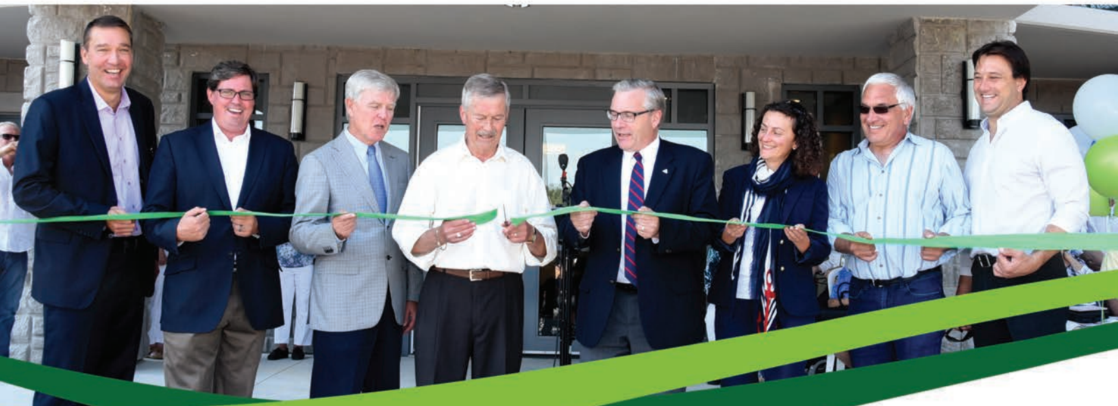
Recognizing our Founders