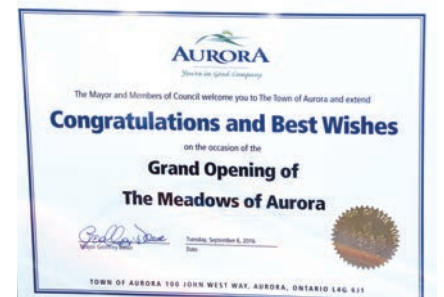
Welcome to the Town of Aurora